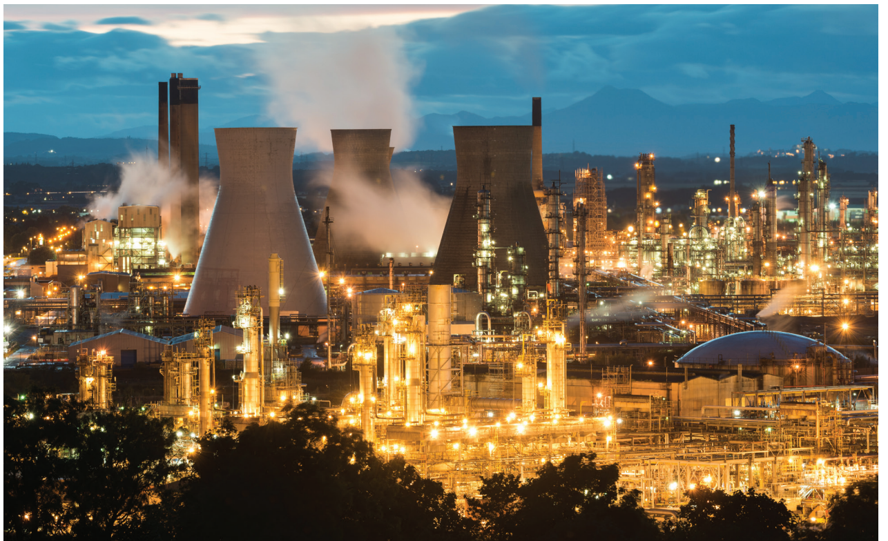
Grangemouth Oil Refinery Scotland

Process performance and gas distribution asset integrity are not the only reasons for careful analysis and control of CCS CO 2 purity. The safety of the personnel operating the CCS equipment and the general public are also of paramount importance. CO 2 intended for CCS may also contain trace levels of highly toxic chemicals such as mercury or hydrogen cyanide. Whilst operators cannot always prevent these molecules being present at tiny levels, they can monitor their concentrations to ensure that they exist in the gas