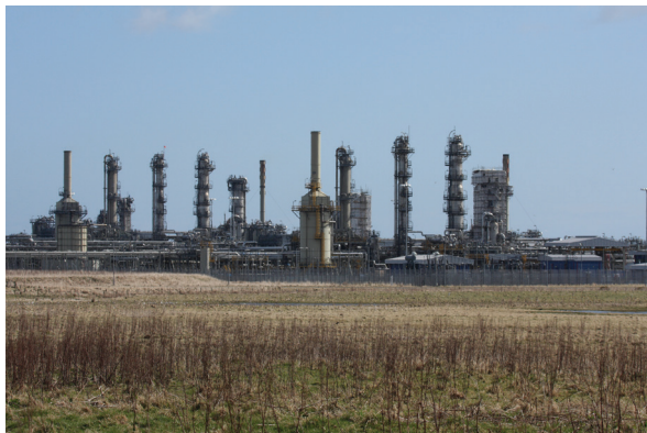
St Fergus gas receiving terminal

The examples above focus on hydrogen and methane but there are transferrable lessons to CCS because these gas standards need to specify maximum concentrations of similar impurities which could be harmful to the application. There may also similarities in the most suitable analytical methods to conduct analysis of trace impurities. So, in the consideration of a future standardised purity specification for CO 2 in CCS applications, there may be some parallels to learn from.