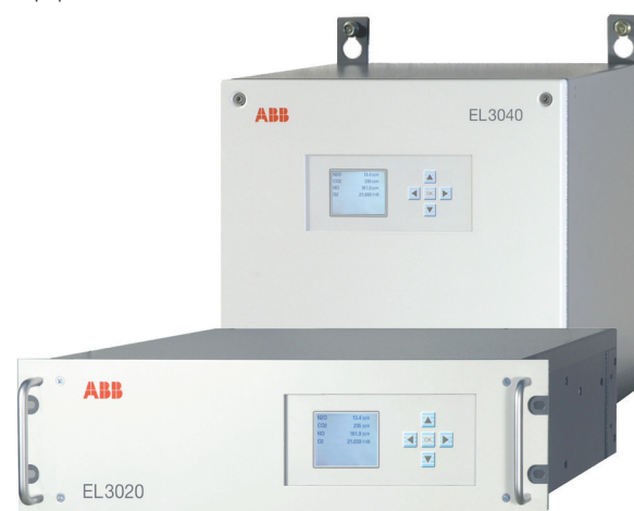
ABB EasyLine Gas Analysers

Many nations in may also wish to participate in CCS schemes, but if their country does not have the appropriate geological profile, they must rely on exporting their CO 2 . So, for the trade in CO 2 for CCS will inevitably become international. This is a key driver for the development of an international standard for CCS CO 2 purity to ensure a harmonised approach and consistent levels of safety. The standard will also lock in parameters that players in the CCS industry can design around to ensure optimal performance of their equipment.