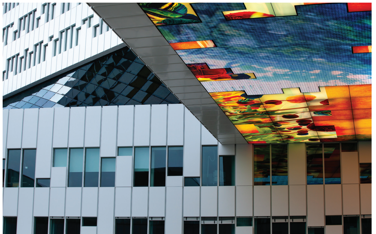
Equinor Head office Oslo

Before we store CO 2 deep underground, we must ensure that important gas purity criteria have been met. However, at present