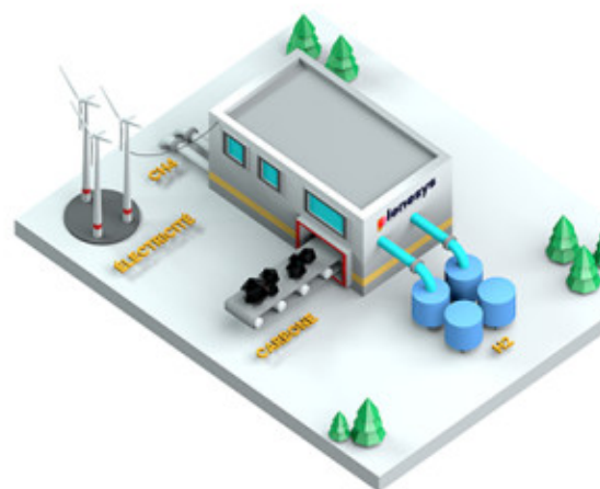
Plenesys hyplasma graphic,