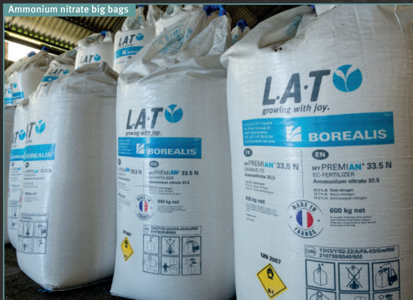
Ammonium nitrate big bags

used to feed the nitric acid absorption column to achieve process intensification and integration.