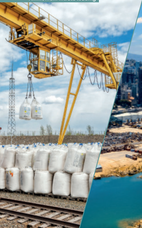
Ammonium nitrate loading