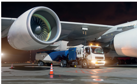
Jet airliner refuelling

LanzaTech's process was demonstrated at pilot-scale in 2008 using flue gases from the BlueScope Steel mill in Glenbrook, NZ. Since then, LanzaTech has successfully deployed its technology at two 300 tonne per annum demonstration facilities at Baosteel