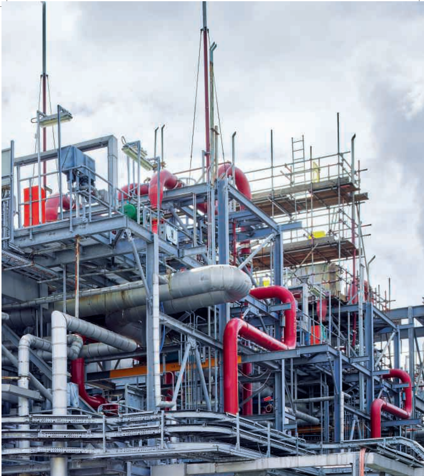
A boiler plant which can switch between operating on natural gas or hydrogen, depending on the availability of hydrogen from the cellroom