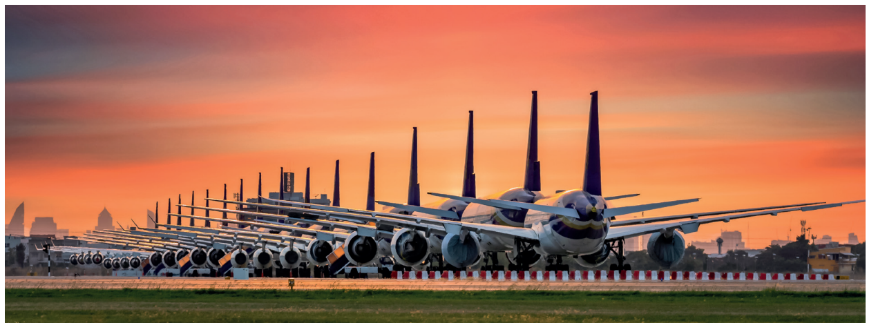
Air water and renewable power for e-fuels and e-fertilizers

The EU regulation related to the production of renewable fuels of non-biological origin (RFNBOs), such as sustainable aviation fuel (SAF), prohibits the use of fossil carbon dioxide (CO 2 ) captured from power generation after 2036. In 2042, the production of RFNBOs using CO 2 captured from so-called 'unavoidable' industries, such as cement making, must be phased out.