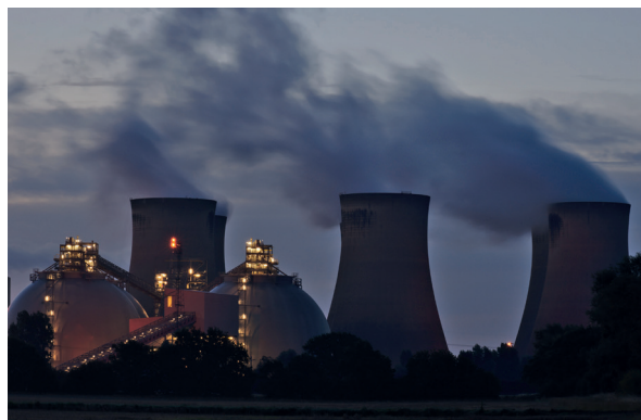
DRAX biomass-fired power station, UK

Biogenic CO 2 can be captured from biogas to biomethane upgrades in many small plants. It is also produced when crops are fermented to yield ethanol, a liquid biofuel. However, these sources of biogenic CO 2 are limited. The price of biogenic CO 2 is likely to rise as e-SAF producers chase the available molecules. A growth in bio-energy carbon capture (BECC) will be needed to