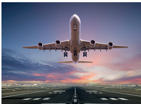
Power to X can be used to make sustainable synthetic aviation fuel

supply the additional biogenic CO 2 molecules. And, when these sources are sold-out, Power to X plants will be forced to seek alternatives such as CO 2 from direct air capture (DAC).