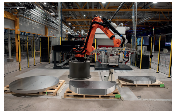
Nel alkaline electrolyser production

Through the analytical technique of radiocarbon dating, the proportion of biogenic and fossil CO 2 can precisely be measured. This will be essential to ensure that the WtE plant operator pays the correct fee for their CO 2 emissions and will simultaneously enable accurate assessment of the biogenic fraction of CO 2 that is captured from the WtE plant flue gas.