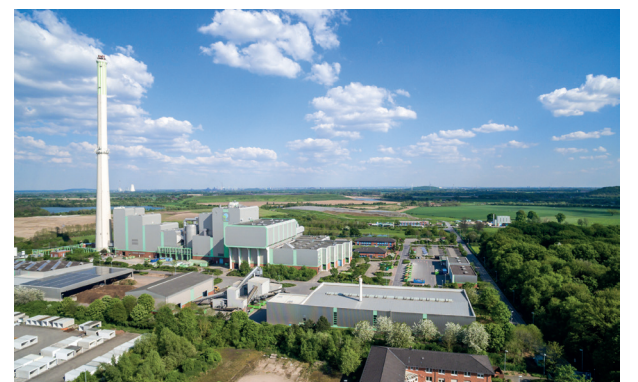
Kamp Lintfort Waste to Power plant, Germany

Bio-energy CO 2 capture and utilisation or storage has generally been linked to the combustion of wood chips to generate power. In 2022, Drax Power Station in the UK, which can generate up to 2.5 GW, emitted 12 million tonnes of CO 2 , making it the UK's largest single emitter of CO 2 in the power sector. This CO 2 is regarded as climate neutral since it was drawn out of the air by the trees.