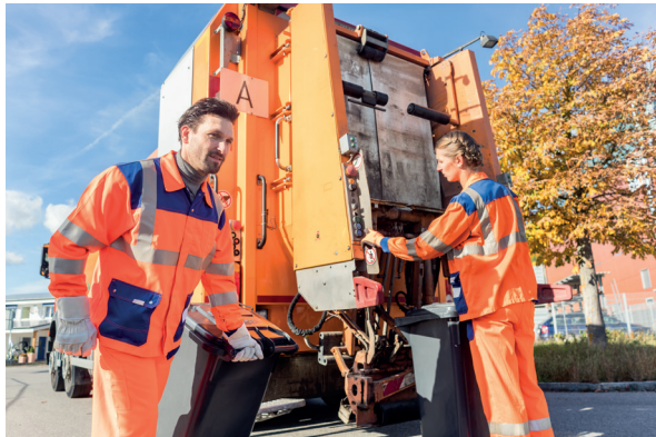
MSW has a high biogenic fraction