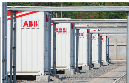
Above: ABB Limay battery installation includes the provision of battery enclosures, EcoFlex eHouses, UniGear ZS1 medium-voltage switchgear, and integrated skid units with transformers and inverters

The Limay installation is the first ABB eStorage Max, pre-engineered, modular, large-scale battery installation to be delivered within the Philippines and APAC region.