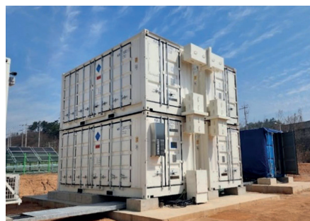
Above: NGK NAS battery installation at Kepco's Naju demo site

NGK Insulators has supplied a 1 MW (DC)/5.8 MWh (DC) NAS battery system to a Korea Electric Power Co (KEPCO) test programme at Naju City