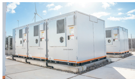
Above: Wärtsilä has fire safety as a major priority for its GridSolv Quantum ESS, complying with UL 9540A unit-level performance requirements and designed to meet stringent safety and quality standards.

"As the risks posed by energy storage systems are better understood by AHJs, the desire to incorporate even more data into the safety analysis requires greater scale and evolution in