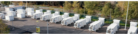
Above: RWE mega battery installation

In addition, RWE recently won an Australian tender for 50 MW/400 MWh of long term storage. ●