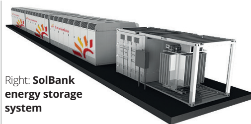
Right: SolBank energy storage system