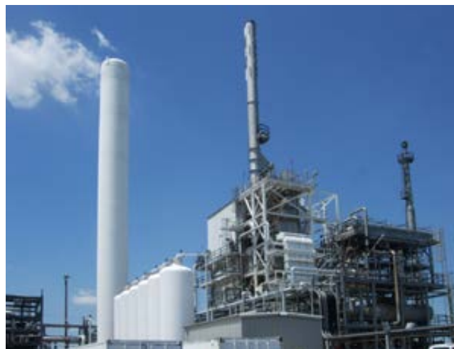
Steam Methane Reformer (SMR), Lima hydrogen cluster, Ohio

Flammable energy gases such as hydrogen and methane demand specific attention due to the danger of fire and explosion. For a leak to air, hydrogen has a lower explosive limit of 4% and an upper explosive limit of 75% - that is an extremely wide range. And spark ignition from electrical components or maintenance activities is an ever-present risk. The combination of these hazards adds up to a high-risk situation and the need for explosimeters and flame detection systems becomes clear in