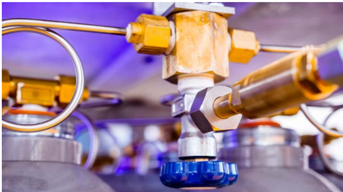
Cylinder gases operations

plants for operating companies they want us to deliver a fully engineered solution. So, we bring in specialist gas detection companies to select the right