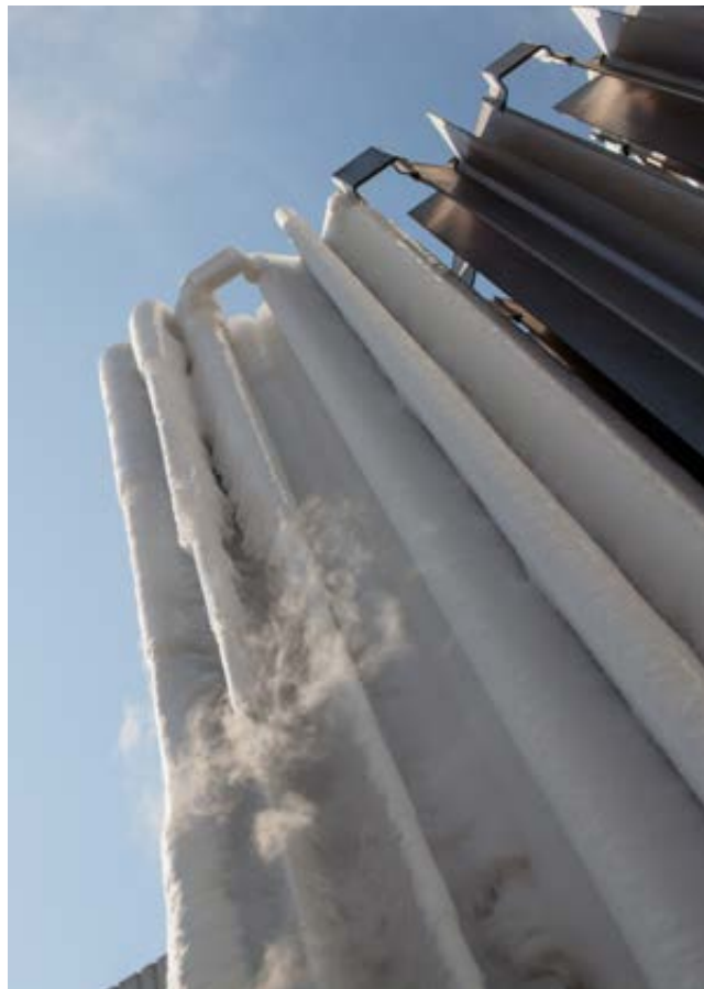
Bulk liquid nitrogen vapourisers

As an example of a customer application, food freezing factories using cryogenics such as liquid nitrogen or liquid carbon dioxide will also require gas detection equipment. A combination of wall mounted sniffers close to the processing equipment and wearable devices is often used. Beyond these cryogenics, gases for use in mechanical refrigeration systems are also supplied by many industrial gas companies. The use of hydrocarbon refrigerants in this area is becoming increasingly popular due to their low environmental impact and excellent thermodynamic performance. Their application stretches from food processing factories to small domestic refrigerators, super-market food display cabinets and world-scale natural gas liquefaction systems.