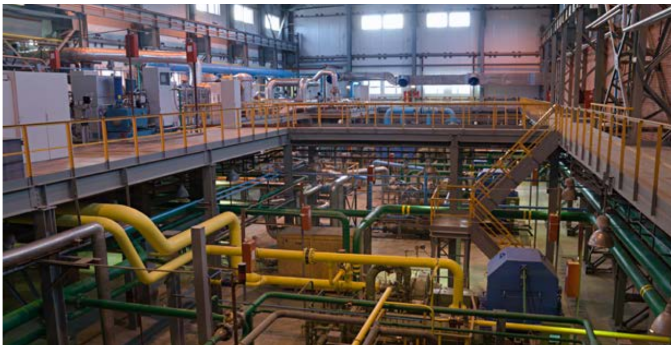
Motors, gas compressors and piping – an ASU machine room has many potential gas leak hazards