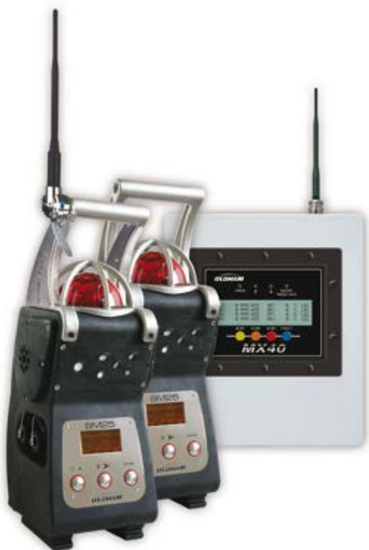
BM 25 Wireless and BM 25 Transportable Multi Gas Monitors for area gas detection and the MX40 Wireless controller

Entry into confined spaces presents an additional risk due to reduced ventilation and the potential for hazardous gas accumulation. Kevin O'Donnell says that “wearing a portable gas detector as part of