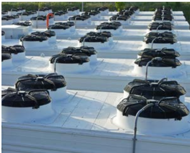
Ammonia refrigeration system evaporators

Cylinder and bulk liquid gas storage areas at customer sites, eg specialty gas cylinder stores at universities, toxic gas cabinets at semi-conductor producers or the medical cylinder gases stores at a hospital may also require gas detection equipment. Industrial gases field service personnel, such as customer engineering services teams working on tank maintenance or drivers making bulk liquid deliveries will also need gas detection equipment. Bulk carbon dioxide deliveries to a brewery or beverage bottling plant may warrant the use of a CO2 detector. Liquid oxygen deliveries to local hospital bulk storage tanks may call for the use of an oxygen gas detector. And, applications specialists visiting from the industrial gases provider for process optimisation will most probably have an appropriate wearable gas detector as part of their PPE kit.