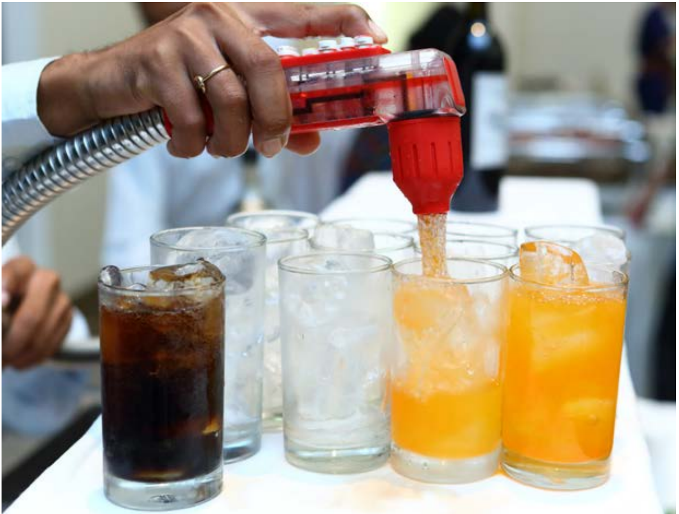
Carbon dioxide for carbonated beverages