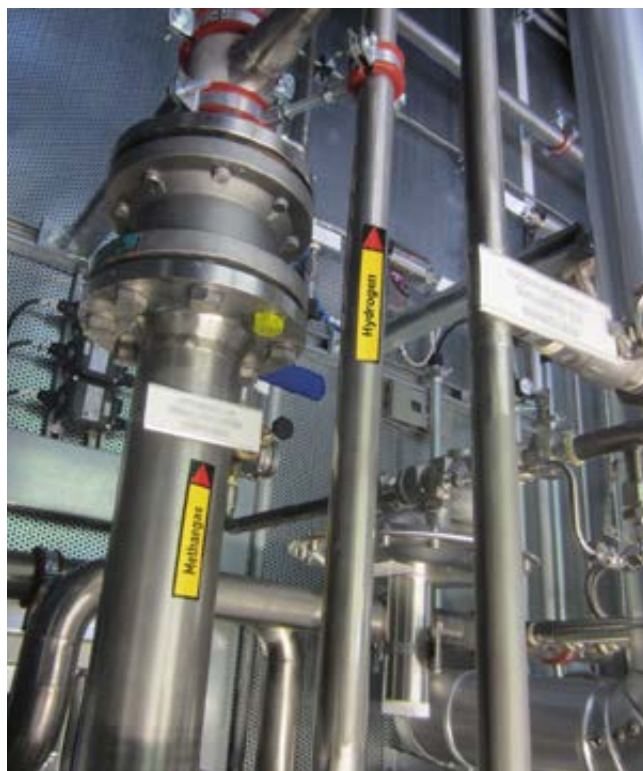
Hydrogen gas grid admixing.