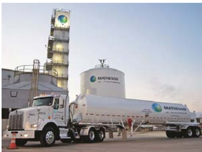
A merchant ASU for the production of liquified oxygen, nitrogen and argon.

Furthermore, preparation and training in a suitable evacuation plan which can be executed in the event of a gas detector alarm is one of the most important site emergency procedures.”