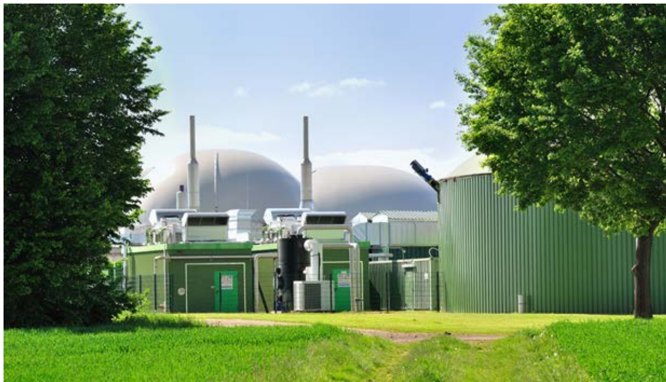
Biogas plant with biomethane upgrade and CHP units

The critical link in the chain between the production of a hydrogen electrolyser and its use will be the hand-over documentation which will include a user manual. Schnotz adds that “many of the safety management cases will be implemented into the equipment design. However, some residual risks will exist, and these must be identified in the operating manual so that the user of the equipment is able to implement appropriate mitigation. Gas leak hazard mitigation is one such example. The operating manual is likely to refer to the requirement for ventilation and gas detection. When we are inspecting an installation prior to certification, we review the hand-over documentation and check that all the required precautions have been correctly incorporated into the final installation. Our goal is to make sure that nothing is left to chance because we know how hazardous hydrogen can be”.