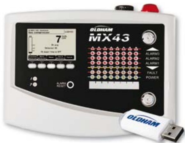
Teledyne Gas and Flame Detection MX43 control unit

For many flammable gases with a carbon atom in the molecule, such as methane which is a common feedstock for SMRs and propane which can be used as a refrigerant gas, an infrared sensor can be used. François Ampe of Teledyne Gas and Flame Detection explains that “hydrogen is also a flammable gas, but unlike hydrocarbon gases, the hydrogen molecule contains no carbon atoms and is therefore not infrared active. So, for hydrogen gas detection a specialist catalyst bead type of sensor must be used. This is the kind of essential knowledge that we offer to our customers when we help them select the most appropriate gas detection system”.