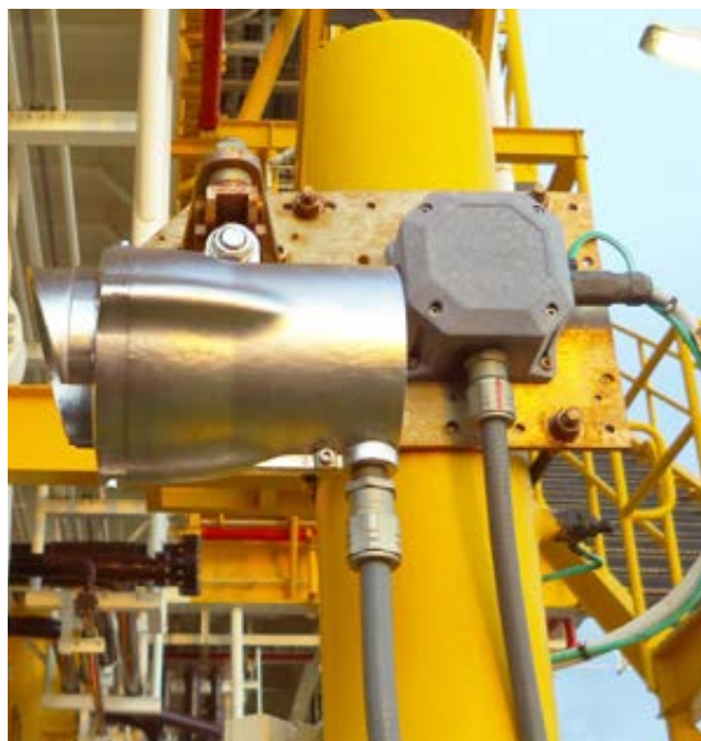
Line of sight gas and flame detection

Given the differences that exist, is there a right or wrong gas detection system? Or is it the case that each has its purpose and a combination of strategies is the most effective solution? The consensus is that an integrated array of open path gas and flame detection equipment, fixed gas detection systems, portable and wearable gas detectors and is the most effective solution.