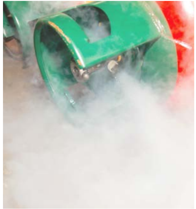
Leaking ammonia gas cylinder

Natural refrigerants such as carbon dioxide and ammonia must also be used with appropriate precautions. Parola adds that “ammonia is used extensively in large scale commercial and industrial refrigeration equipment. It has zero global warming potential, which is a major reason for its selection. However, the gas is both toxic and flammable. An ammonia leak might be detected through our sense of smell, but we should not rely exclusively on our nose as a warning system: gas detection equipment should also be considered”.