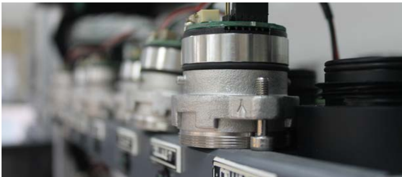
Selection of sensors to be built into gas detection equipment.

Oxygen is generally detected using an electrochemical fuel cell. François Ampe says that “measuring oxygen enrichment and deficiency is achieved using the same sensor, so a leak of oxygen which causes oxygen enrichment or a leak of nitrogen or argon which would cause oxygen deficiency can be detected using similar devices”. Oxygen, nitrogen and argon are three of the main hazardous gases processed on an ASU.