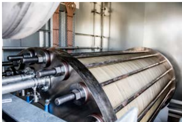
0.5 MW, 200 cubic metres per hour McPhy Hydrogen Electrolyser.

There are various international technical standards that we follow when considering the safety of our electrolyser installations, for example the ‘ISO 22734-1: Hydrogen generators using water electrolysis process – Industrial, commercial, and residential applications’. On the topic of gas detection for safety, in section 4.2 it stipulates that: ‘Hydrogen generators shall be designed and manufactured such that where a release of flammable gas occurs during normal operation, the formation of a flammable atmosphere is prevented, minimized, detected, and/or controlled’. In section 4.4.1.9 it continues to specify the standards to which the gas detectors must be manufactured, installed and maintained. The requirement to evaluate the reliability of the gas detection system is stipulated. It also specifies that: ‘The hydrogen gas detector(s) shall be installed in optimum location(s) to provide the earliest detection of hydrogen gas, such that their protective function can be proven’.