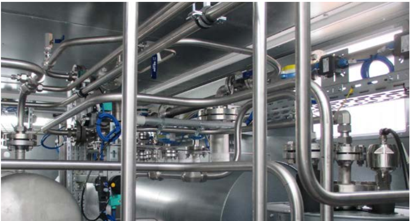
Hydrogen electrolyser installation.

at the operator’s site. He says that “TÜV SÜD are approved by the European Union to certify equipment under the PED which is to be put into service anywhere in the EU. The next stage in the process becomes national. As a German entity, we are authorised to conduct the inspection and certification of the final installation which the operator is responsible for, if it is installed in Germany”.