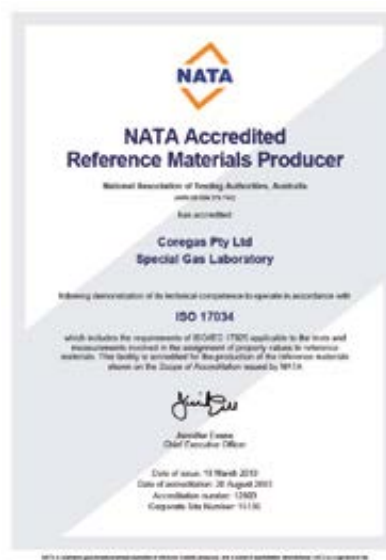
Coregas ISO17034 NATA Accreditation certificate

analysed with full ISO 17034 certification. Abbott says that “our biggest cylinder, the G size is popular in laboratories where gas detection equipment is manufactured and recertified. Smaller portable refillable cylinders are ideal for in-situ bump testing or calibration. This is especially useful for servicing gas detectors located in diverse locations around industrial gases production facilities or customer sites where they are using industrial gases”.