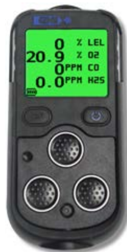
PS200 portable Multi Gas detector

specialty gas mixtures. “Our specialty gases accreditation journey began in 1997 when we achieved ISO17025 accreditation as a calibration laboratory for gas mixtures. Subsequently, Coregas achieved ISO Guide 34 accreditation in 2002 which made us the first accredited gases reference material producer in Australia. Furthermore, the updated version of ISO Guide 34, which is called ISO 17034, was implemented in 2018 and we achieved accreditation for that new standard in December 2018. One of the main purposes of these accreditations is to demonstrate traceability and our reference materials that we use at Coregas are traceable to Australian National Standards of weights and thus to the International System of Units (SI)”.