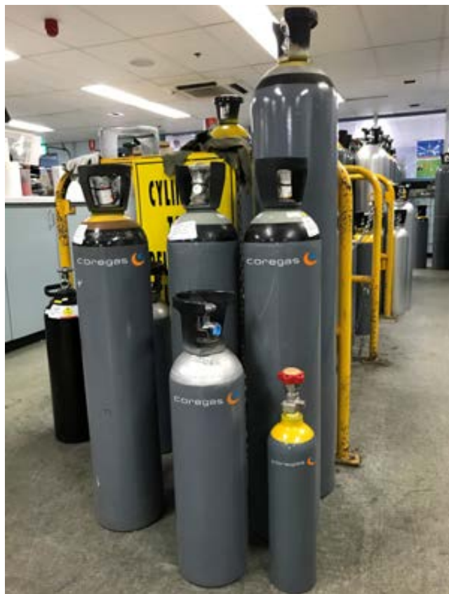
Coregas specialty gas mixture cylinders for gas detector bump testing and calibration