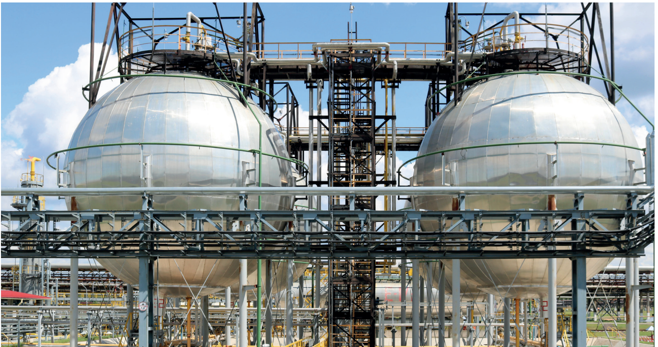
Above: Ammonia storage spheres