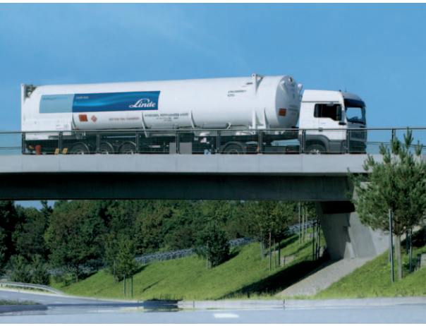
Figure 4. When smaller quantities of hydrogen are required, it can be supplied by tube trailer, stored on site in liquefied format and then vaporised for use as gaseous hydrogen.

Hydrogen is one of the smallest and lightest molecules, but is also one of the most flammable and explosive gases processed at a refinery. Any leakages pose a possible risk of fire or explosion, potentially resulting in damage to capital