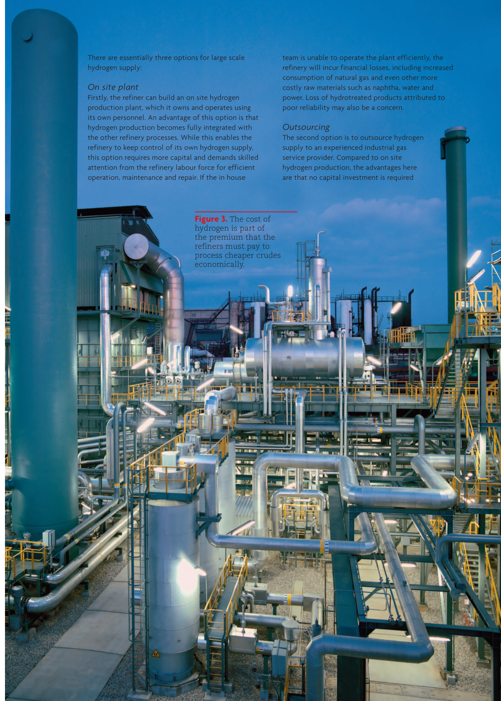
Figure 3. The cost of hydrogen is part of the premium that the refiners must pay to process cheaper crudes economically.

The second option is to outsource hydrogen supply to an experienced industrial gas service provider. Compared to on site hydrogen production, the advantages here are that no capital investment is required