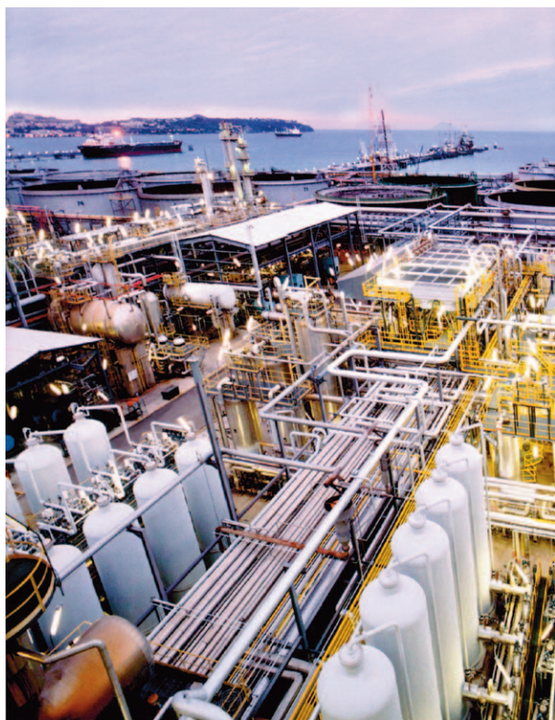
Figure 2. Outsourcing of hydrogen supply has been widely embraced by refiners in developed countries and is being given serious consideration in many other parts of the world.

refine them to the required standards and product slate, thus meeting demand. The alternative is to pay a premium for the lighter crudes. This awkward choice has already impacted many refineries, notably on the east coast of the USA, where refineries originally built to process light and sweet crudes have had to shut down because they could not fund the technology upgrades necessary to process heavier crudes. The cost of hydrogen is part of the premium that the refiners must pay to process cheaper crudes economically.