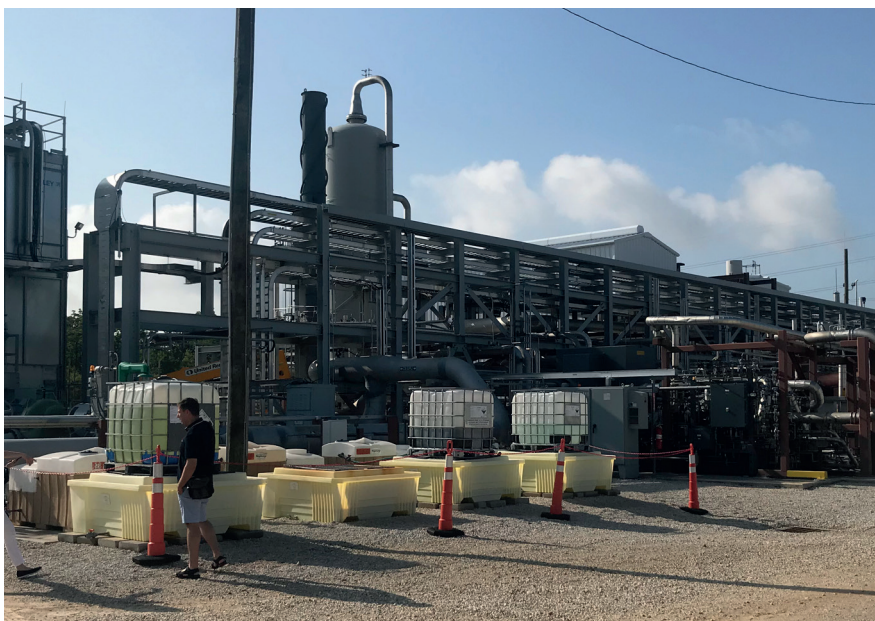
Above: Net Power La Porte demo site