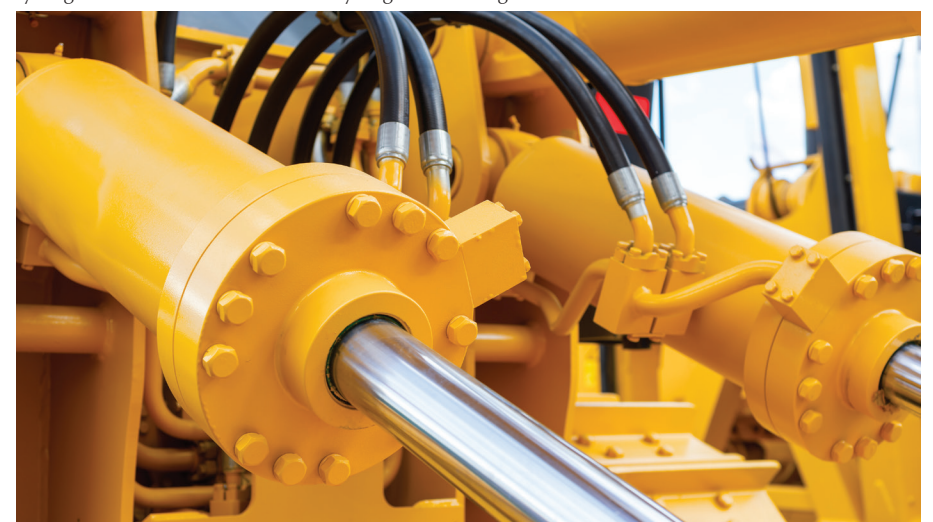
High pressure hydraulics

The FOS is used where small fleets of hydrogen powered cars operate from a fixed location such as city centre taxis or company car fleets. When the vehicles operate close to the FOS and return to base regularly, they can be sure that a top up of hydrogen will always be at hand. The FOS costs only a fraction of the larger public stations, so many fleet operators are likely to find the conversion to hydrogen is more affordable than they might have imagined.