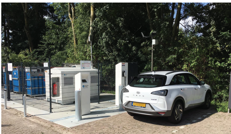
Hydrogen Fleet Owner Station

Hydrogen mobility has a special aura; it is enjoying tremendous attention and few industrial sectors are growing with a similar pace. California, Germany, Japan, the Netherlands and South Korea have committed to invest in hydrogen fuelling station infrastructure. As the sector grows, which industries have the right skills to migrate into the business of making hydrogen fuelling stations? Industrial gas companies are coming from a base in hydrogen production and distribution, international energy majors have historically invested in roadside filling stations for liquid fuels and automotive OEMs may also have a role. There are also several new players popping up in the space, proving that there is room for market entrants with the right mix of capabilities to compete.