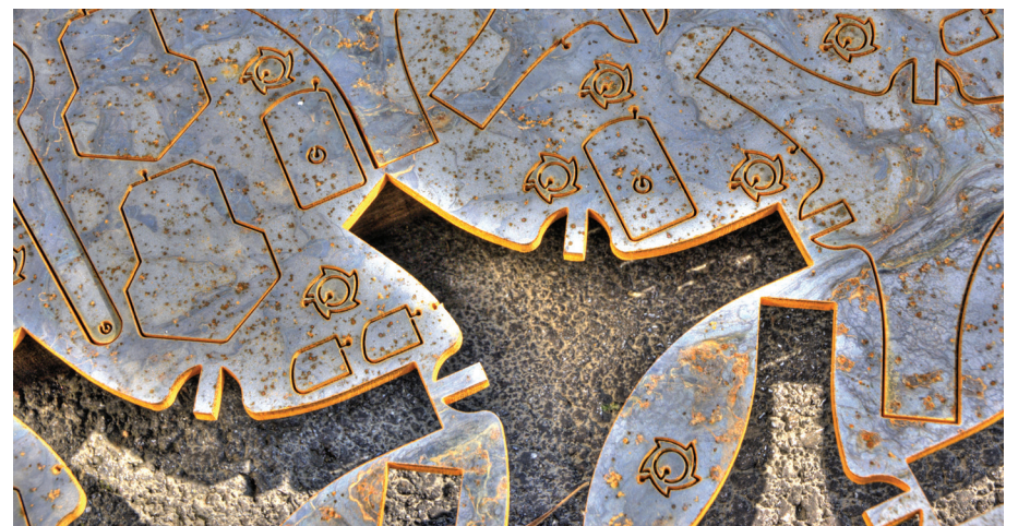
Steel plate cut by a water jet

Beyond high-pressure technologies, the skills that people will need to work in this field are like any other emerging technology. An entrepreneurial spirit, market insight, cross-functional working, creativity, vision and passion will all help. Furthermore, a safety mindset coupled with deep technical and engineering competences are also required to underpin some of the supply chain, production and research roles.