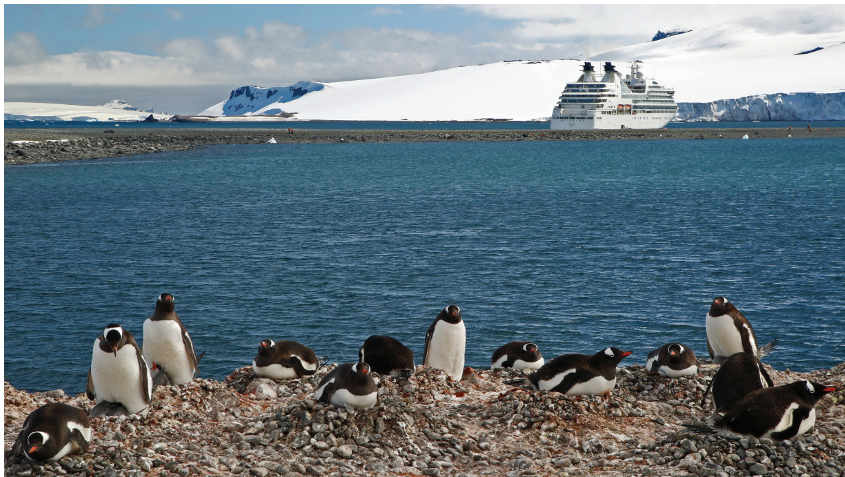
Antarctic cruise penguins