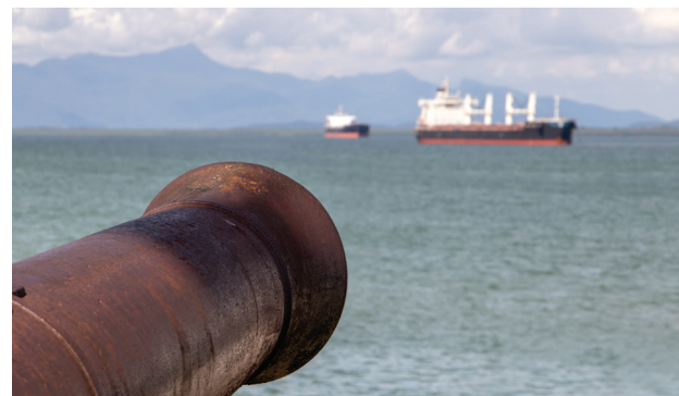
Fort Cornwallis Penag Malaysia

Space is at a premium on ships and carrying calibration gas cylinders on board is not always easy. Also, with the chance of rough seas, cylinders can move around if they are not properly secured. For these reasons, the fewer cylinders that the operator needs to take on the high seas, the better. This is where multi-component mixtures score well – one cylinder contains all the gases that are needed to calibrate the suite of instruments required for marine CEMS.