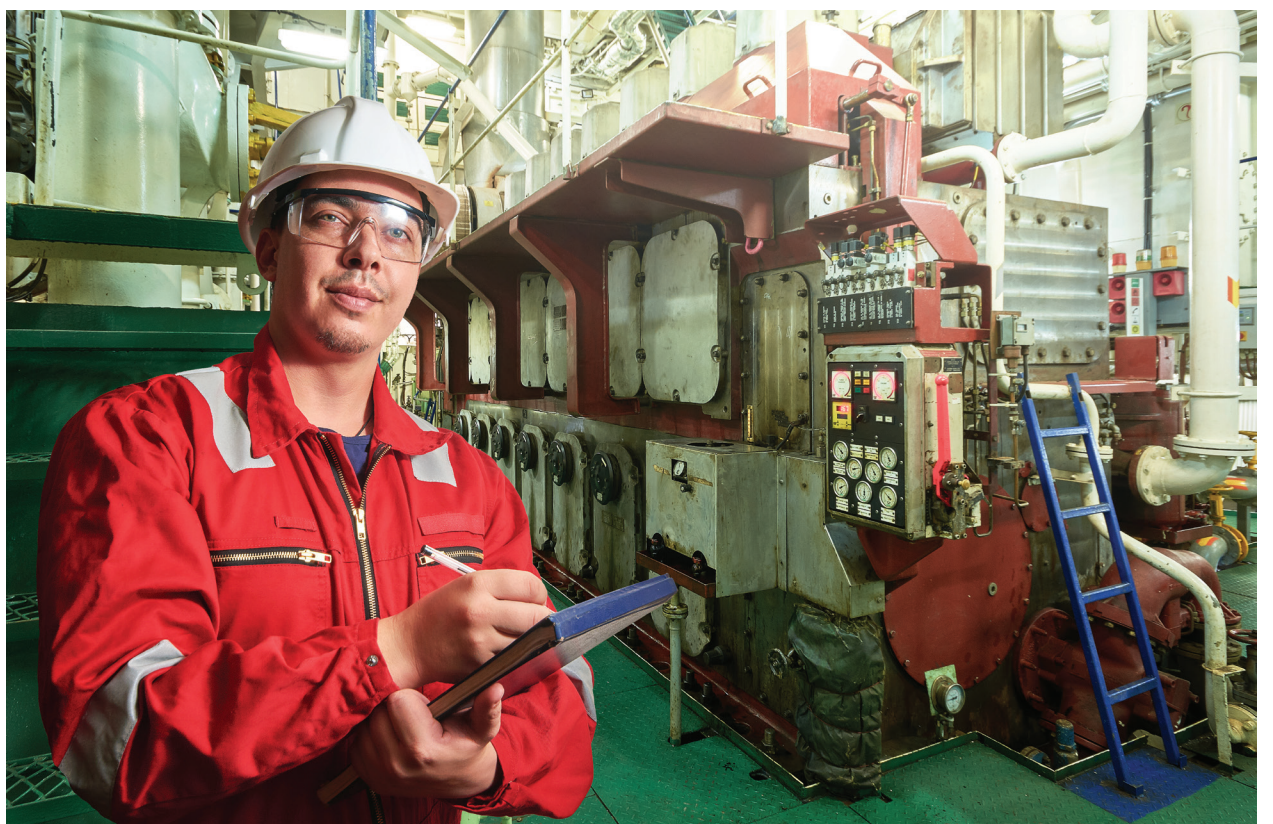
Ship's engine room

In general, EGCSs use either sea water in an open loop system or rely on internal recirculation of fresh water mixed with caustic soda or other alkaline chemical as the scrubbing medium in a closed loop system. Some ports have expressed concerns about the discharge of open loop scrubber wastewater, so the closed loop