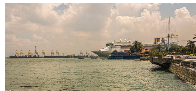
Port of Georgetown Penang Island Strait of Malacca

The regulations stipulate that every ship must carry at least one portable gas detection instrument which as a minimum is capable of measuring concentrations of oxygen, flammable gases or vapours, hydrogen sulphide and carbon monoxide. These so called 'quad gas' detectors must be used prior to entry into any confined space, and at appropriate intervals until the work is completed. Going beyond this minimum requirement, when roll-on, roll-off car ferries are loading and unloading in port the decks and ramp areas quickly become smoggy. For the personnel involved in supervising these traffic movements, wearing portable gas detectors may also be advisable.