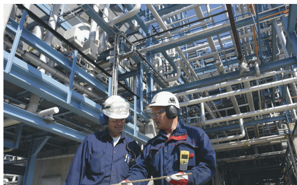
Figure 2. Environmental legislation demands accurate and precise measurements to ensure refineries are operating within its consent levels.

The impurity levels used in the MACPoll project refer to a set of EN standards, for example, EN 14211. These standards define very ambitious specifications for zero gases, including 0.5 ppb (or 500 ppt) nitrous oxide, 2 ppb ammonia and 1 ppb sulfur dioxide. Considering that as recently as 10 years ago, a typical impurity of nitrous oxide would have been in the